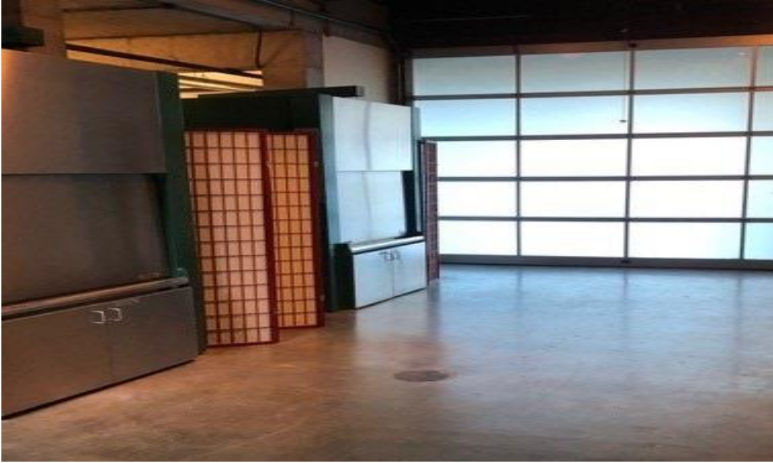
Crematory Remembrance Suite