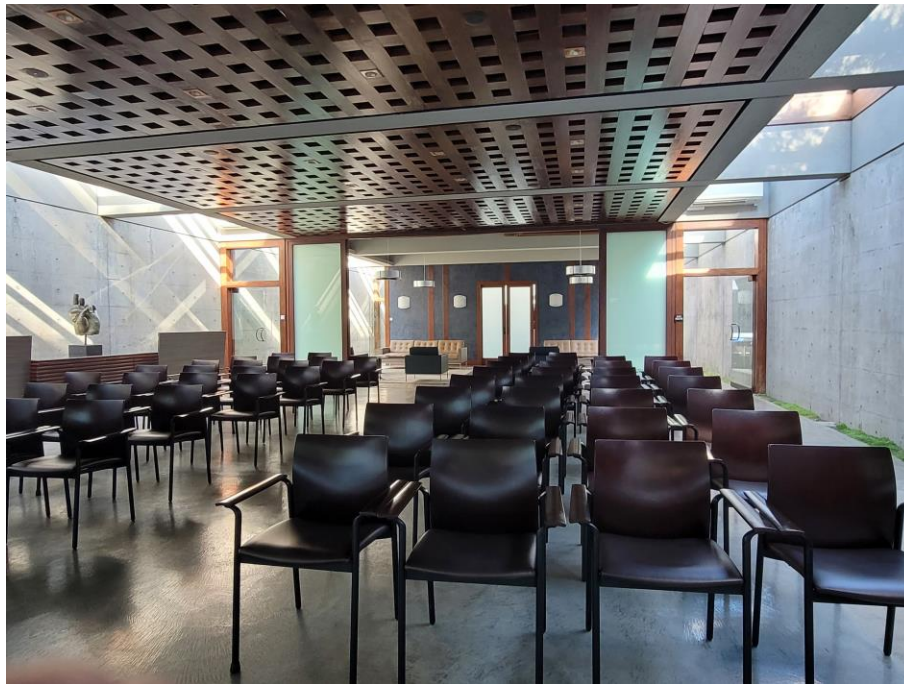
Fernwood Remembrance Room