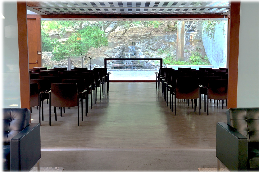
Fernwood Remembrance Room